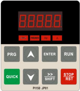
Figure 4-1:Operation panel display